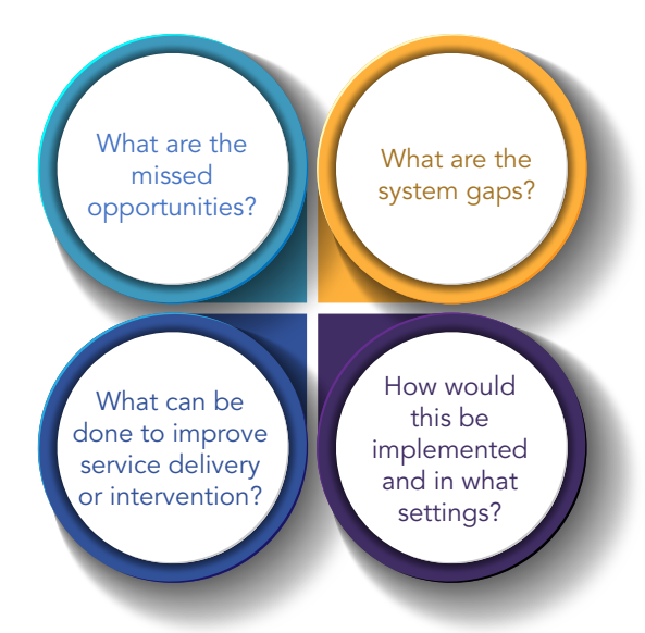
Figure 2.1 Problem-Solving Process to Identify Recommendations